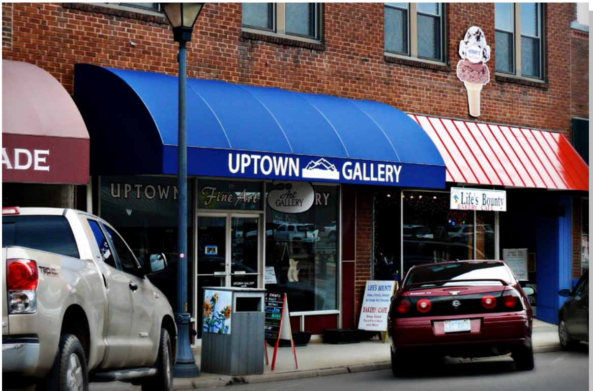
The New Canopy at the Uptown Gallery

FULL HOUSE IN MARCH: March's Children's Workshop was tuition free for ten budding artists, six girls and four boys each used metallic gold scratchboard to create a portrait of a lion. The Children's program is made possible by a grant from The Community Foundation, The Uptown Gallery and donation of time and supplies by MCAA members.